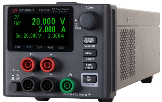
Option J01 recessed binding posts